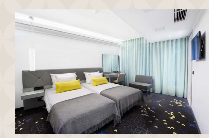
Business class rooms 19-22 m<sup>2</sup>