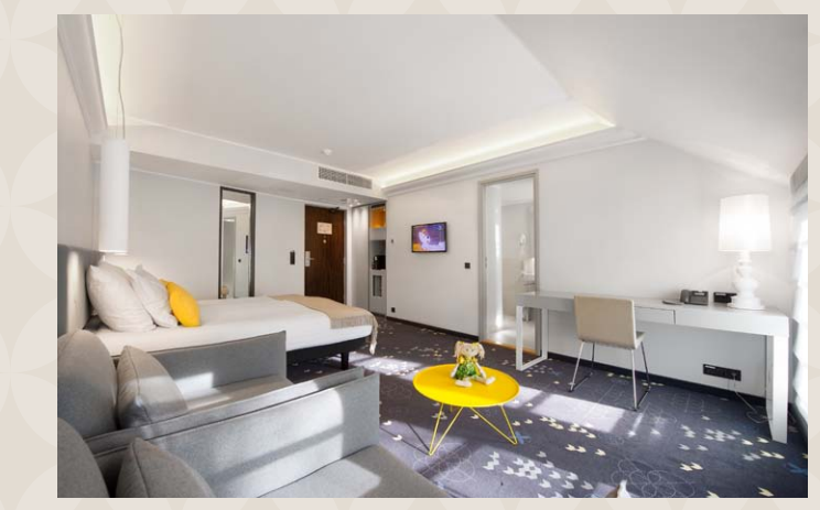
Superior class rooms 25-31 m<sup>2</sup>